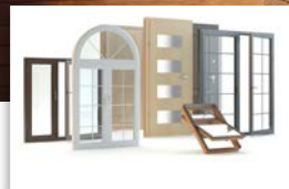
Surface and joint bonding | Profile wrapping | Edge banding