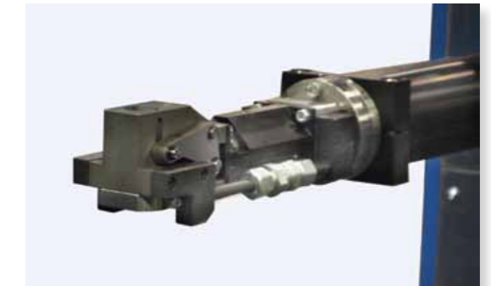
High pressure mixhead

KLEIBERIT is committed to continuous innovation and quality and has over 40 years experience specialising in the manufacture of polyurethane adhesives. KLEIBERIT continues to invest in equipment to enable the testing of new developments.