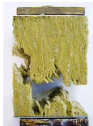
Tensile strength (material break mineral wool)