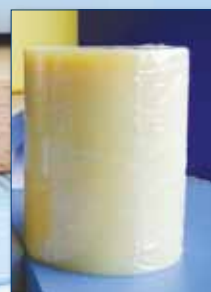
KLEIBERIT 782.5 Supramelt The transparent hotmelt cartridge - ask for the relevant data sheet.

The laboratory of both HOLZHER and KLEBCHEMIE have tested and approved this product.